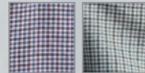
Blue Check Green Check