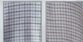
Blue Check Brown Check