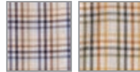
Blue Check Brown Check